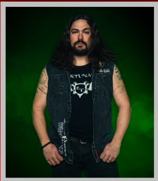
Sly Tale Drums